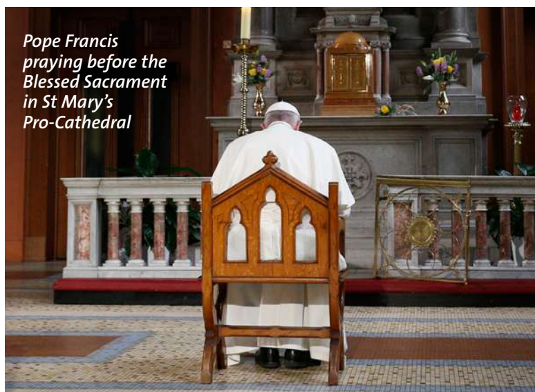
Pope Francis praying before the Blessed Sacrament in St Mary's Pro-Cathedral

The group bonded quickly. Seven of the eight were happy to be identified, but the eighth person asked not to be, a wish that was honoured by the others. They also agreed to meet with the Pope as a group, which made for a much better use of the available time. Pope Francis arrived at the Nunciature at about 5.10 and the meeting commenced within five minutes. There was another meeting scheduled to take place after the meeting with the survivors, after which Pope Francis was due at the Festival of the Families in Croke Park. There was not a lot of time. Pope Francis went into